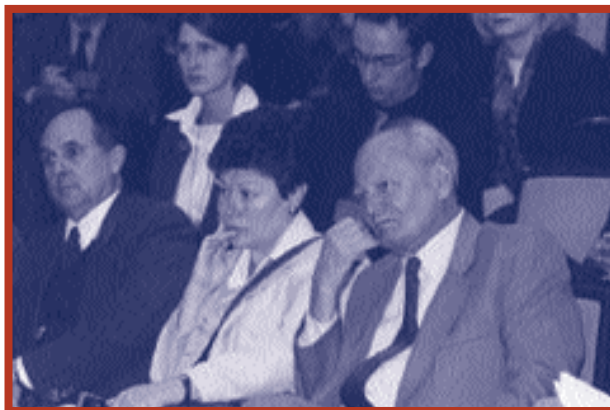
Former President of Hungary Árpád Göncz (right) and Cristovam Buarque (left), President of the Brazilian NGO Missao Crianca

For some, globalization is the source of all that is modern, progressive and good in the contemporary political economy; for others, it is the major source of poverty and inequality in the world. The conference aimed to go beyond this polarization of views and achieve a constructive debate.