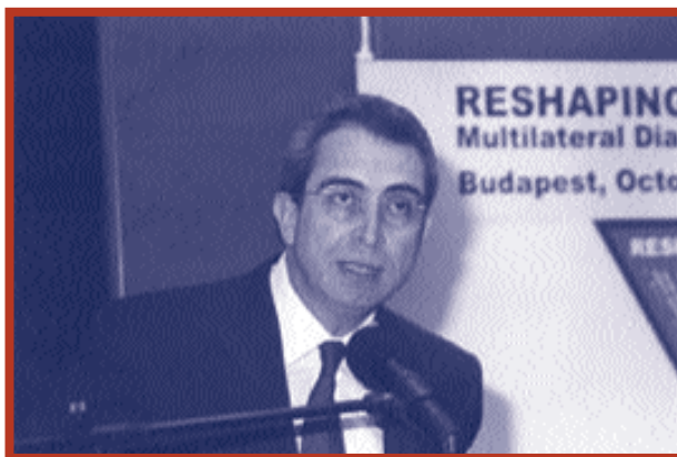
Ernesto Zedillo, former President of Mexico

On October 19, George Soros presented the Soros Report on Globalization , which gave practical proposals for the reform of international financial and trade institutions. "We need a system of incentives that encourages voluntary compliance, in addition to the WTO rules-based system," Soros suggested, introducing a system for earmarking IMF Special Drawing Rights for aid initiatives. "Foreign aid has a bad name, and justifiably so. It is guided by the interests of the donors, not the interests of the recipients." Participants from NGOs and international organizations stressed the need to establish new sources of multilateral finance to support solutions to global problems. "We have global financial markets, but political arrangements that are based upon the sovereignty of states," Soros stressed. Now it is up to those states, he said, to debate and implement and revise global aid policies.