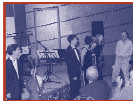
The Academia String Quartet finishes its performance. At right is composer Amos Elkana.