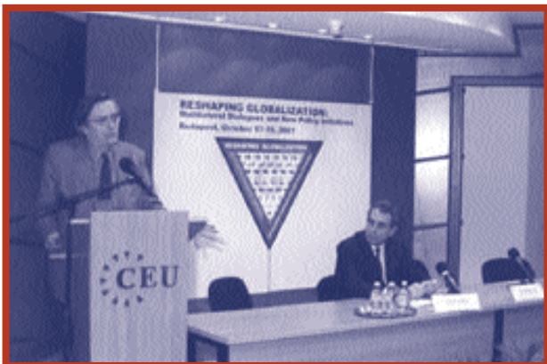
John Gray (left), Professor of European Thought, London School of Economics, and Ernesto Zedillo

Discussions progressed from a broad debate on the protection of public goods in the global economy to an examination of the weaknesses and strengths of the current aid system. Most participants agreed that the nature of the governments in various countries was the major factor in causing poverty, but differed on how globalization and the current aid system was seen to influence that process.