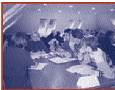
Small-group working session on fundraising

In the second session Jenkins presented two topics: how fundraising is done at US universities and how it could be done at CEU. First, she presented some statistics about small, private, specialized graduate schools in the US—institutions which are similar to CEU—and showed how they organize their fundraising activities, with an emphasis on the resources with which they operate. Then she elaborated on the special challenges facing CEU, and the role of the faculty and the development staff in the university's fundraising activities. Finally, she explained that departmental, program and unit mission statements are required for effective fundraising as these serve as information tools for the development staff and more importantly, possible donors. After the presentation the participants had the opportunity to put theory into practice by putting themselves into the role of a donor and reviewing the mission statements of the units from the donor's point of view. This teamwork resulted in several constructive ideas and ignited a lively discussion on the topic.