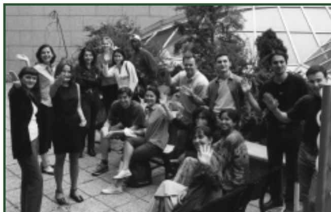
A farewell wave from members of the Class of 2001 in the Japanese Garden